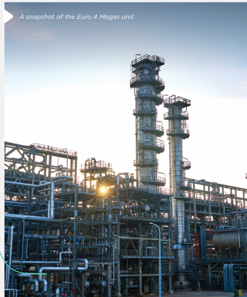
A snapshot of the Euro 4 Mogas unit