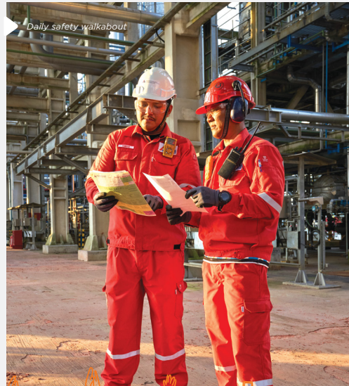
Daily safety walkabout

2,125 Incident prevention via near miss potential incident reporting submissions